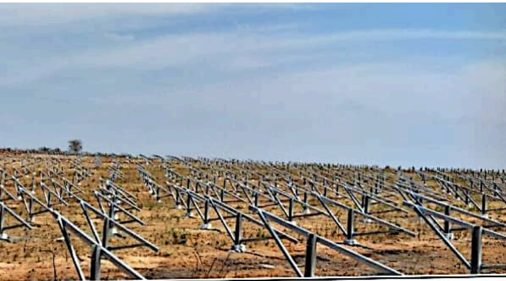
MMS Structure work in Rafter fixing