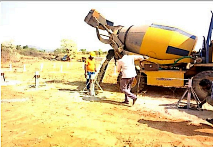
Concreting for MMS foundation