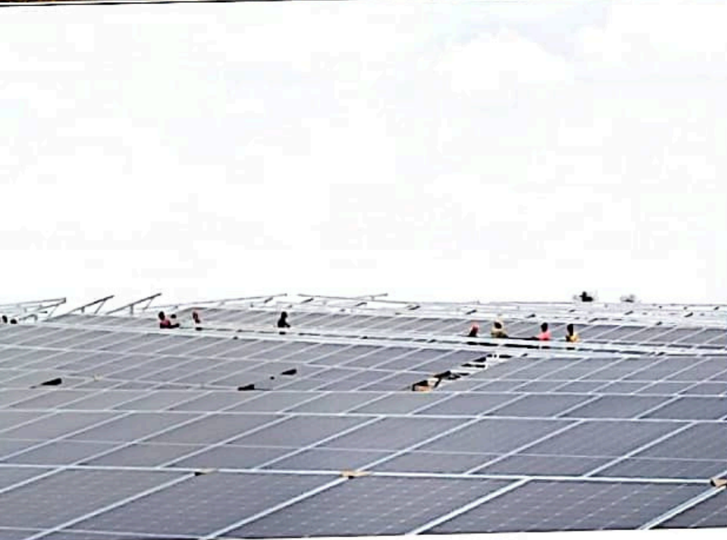
MMS and Module mounting work