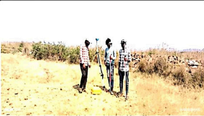
Marking for MMS Pile foundation with Total Station.