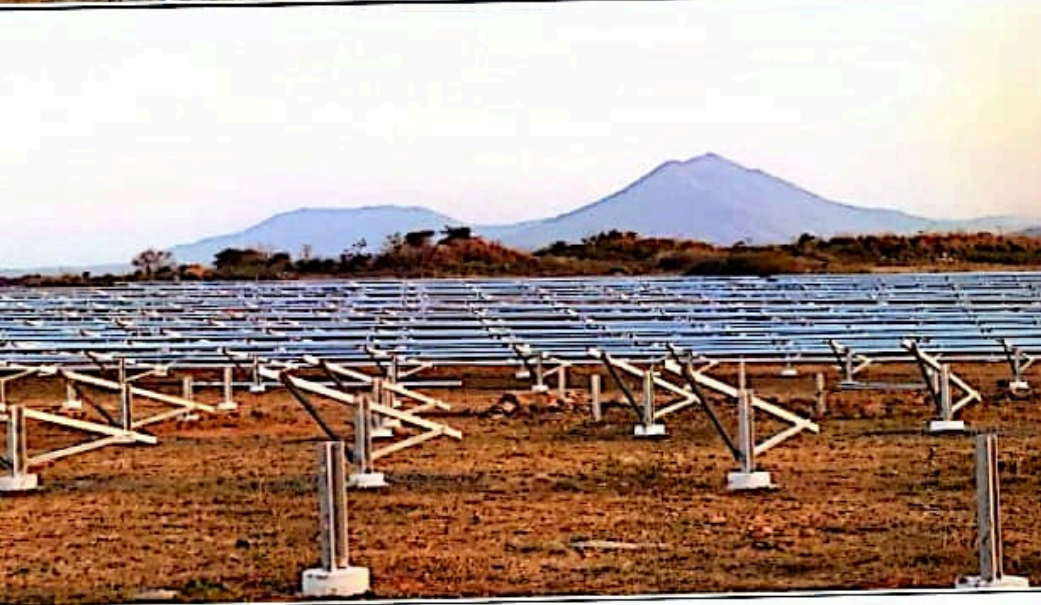
MMS Structure work with rafter and purlins