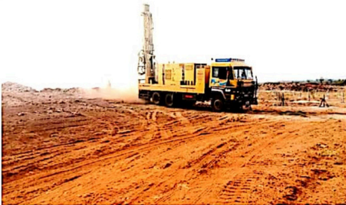
Drilling of MMS Pile foundation with Bore well Machine.